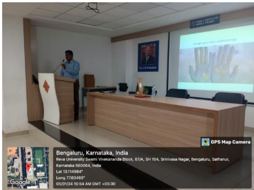
(Resource Person addressing the participants)