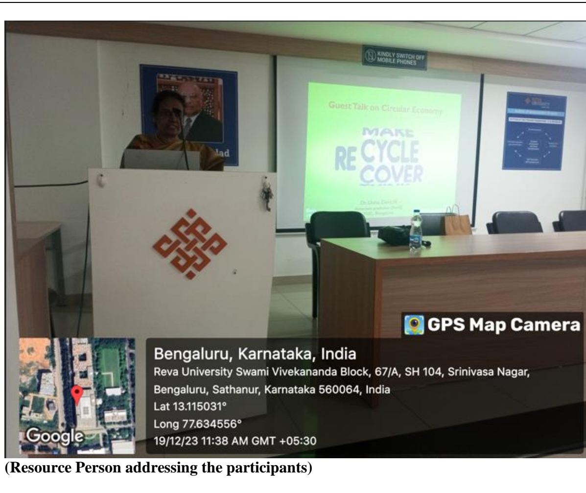
(Resource Person addressing the participants)