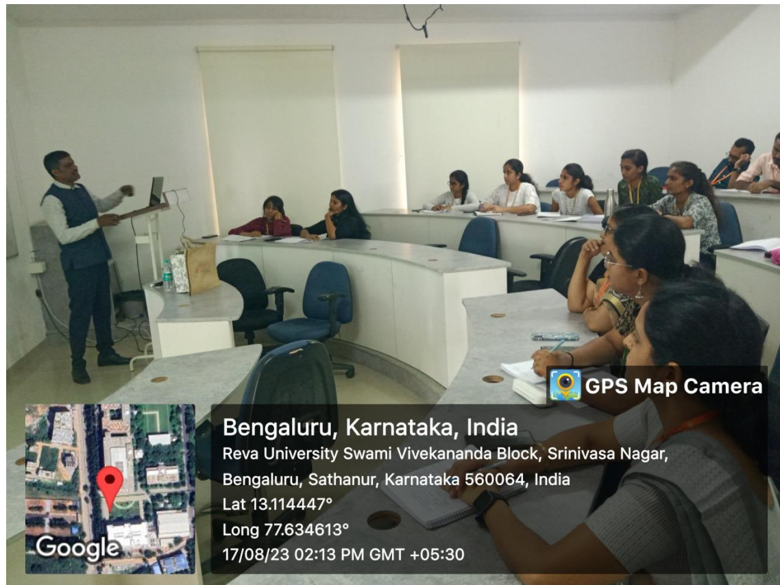
(Resource Person's talk)