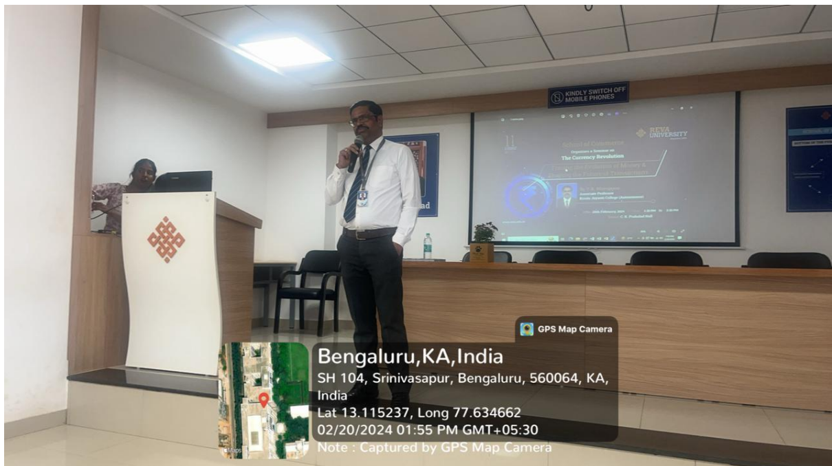
(Resource Person addressing the participants)