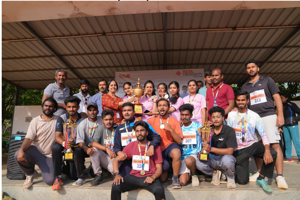
Assistant Physical Education Director

Director of Physical Education & Sports Director Physical Education & Sports REVA University Rukmini Knowledge Park, Kattigenahalli Yelahanka, Bengaluru - 560 064